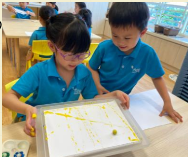
Art & Craft