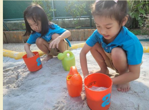
Sand & Water Play