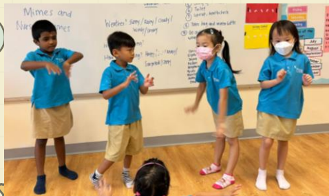
Music, Movement & Dramatisation