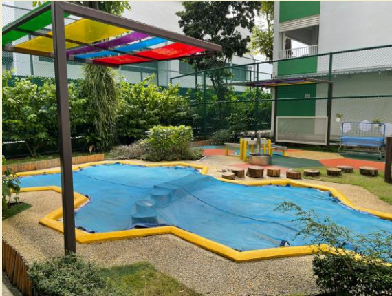
Sand & Water Play Area

Specially designed Sand & Water play area and Sensory Garden for children to use their five senses to explore and find out about the world around them.