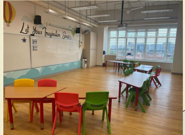
Art & Craft / Tinkering